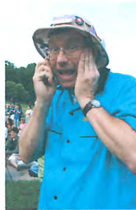
Most Likely to Spaz: Mr. History